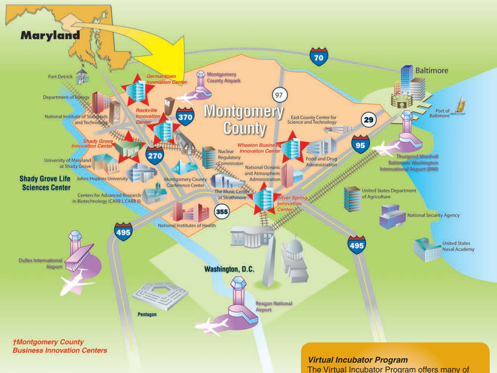
†Montgomery County Business Innovation Centers

Virtual Incubator Program The Virtual Incubator Program offers many of the same business support services available to the Business Innovation Network tenants without their having a physical location within network facilities. Start your business off on the right foot—take advantage of the network’s many resources and services to facilitate the growth and success of your emerging ideas.